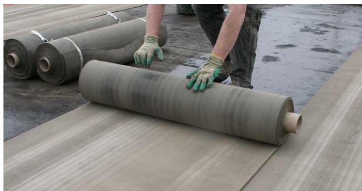
CC Batched Rolls