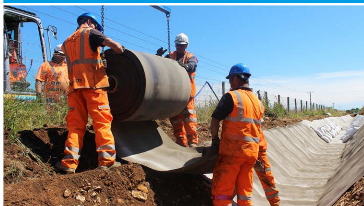
CC Bulk Roll